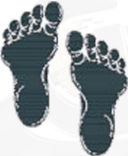
Scan of child's feet

Please note: The space on the certificate seen with baby foot prints are to be an actual scan of the dedicatee's feet.